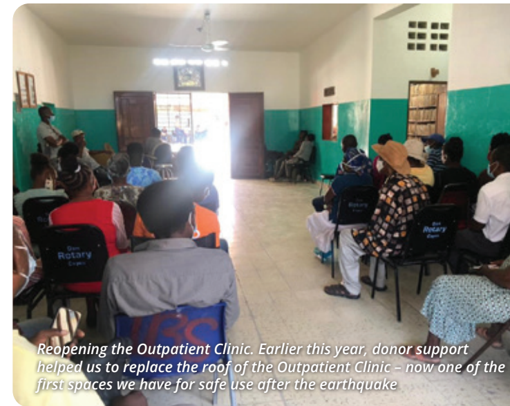
Reopening the Outpatient Clinic. Earlier this year, donor support helped us to replace the roof of the Outpatient Clinic – now one of the first spaces we have for safe use after the earthquake