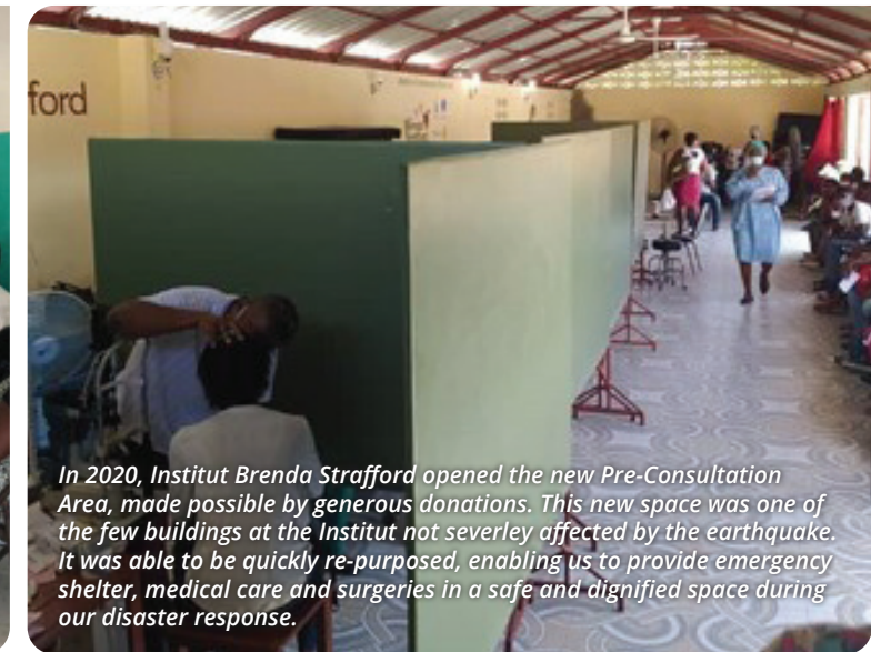
In 2020, Institut Brenda Strafford opened the new Pre-Consultation Area, made possible by generous donations. This new space was one of the few buildings at the Institut not severely affected by the earthquake. It was able to be quickly re-purposed, enabling us to provide emergency shelter, medical care and surgeries in a safe and dignified space during our disaster response.