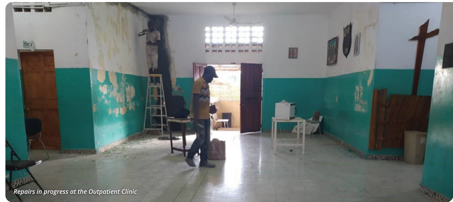
Repairs in progress at the Outpatient Clinic