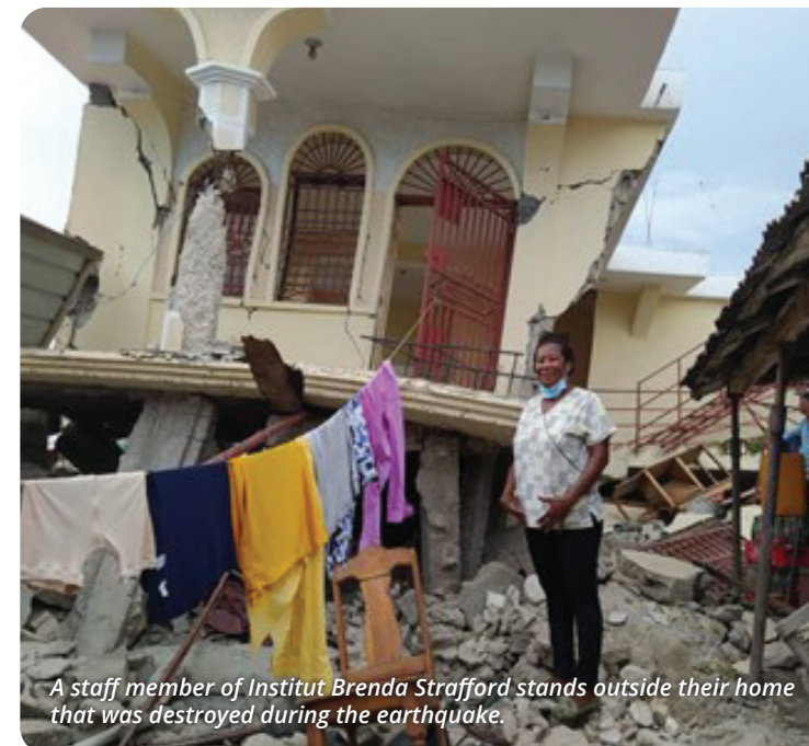
A staff member of Institut Brenda Strafford stands outside their home that was destroyed during the earthquake.