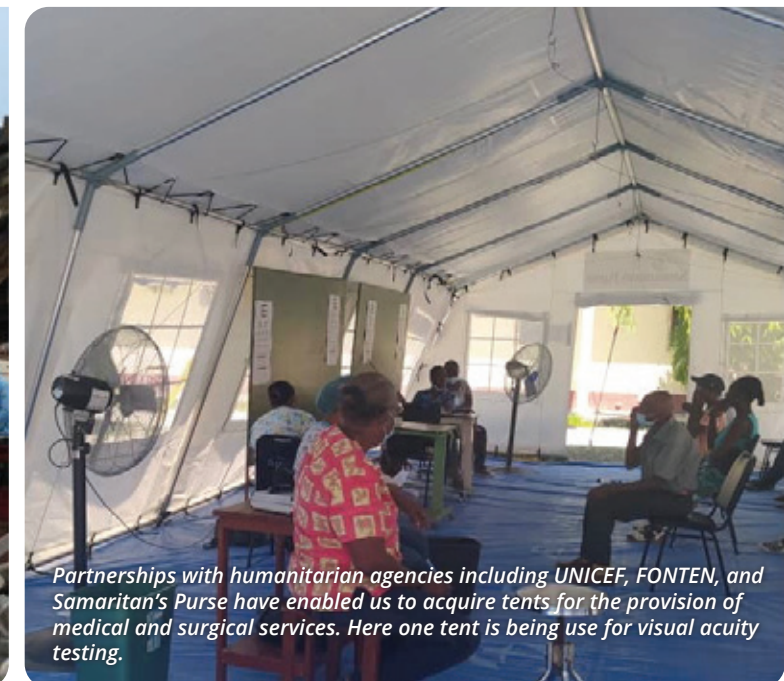
Partnerships with humanitarian agencies including UNICEF, FONTEN, and Samaritan's Purse have enabled us to acquire tents for the provision of medical and surgical services. Here one tent is being used for visual acuity testing.